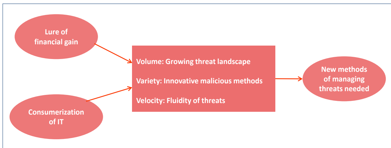
Figure 1. The growing volume, variety, and velocity of data requires new methods of managing threats

Determining whether a particular Web site or page contains malicious content is fluid over time as well. Cybercriminals routinely transform legitimate sites into corrupt sites almost instantly. In one example of many such transformations, in early 2012, cybercriminals installed an iFrame redirection on a popular news site in the Netherlands . What had been a legitimate website that morning infected thousands of people as they perused the compromised site during their lunch hour.